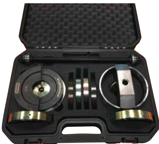
Nr. 432 030